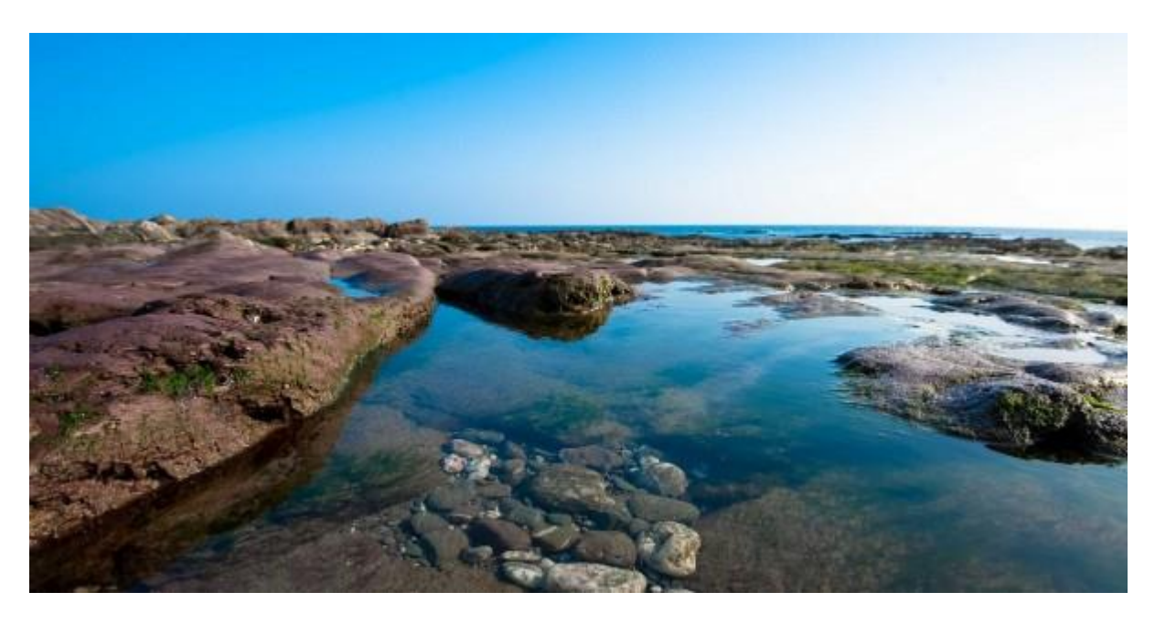
Kingsand & Cawsand – these twin fishing villages have mainly golden sandy beaches. Lots of tea rooms, quaint cottages and windy lanes to explore. SN PL10 1PG